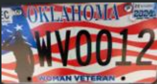
WVO License Plate