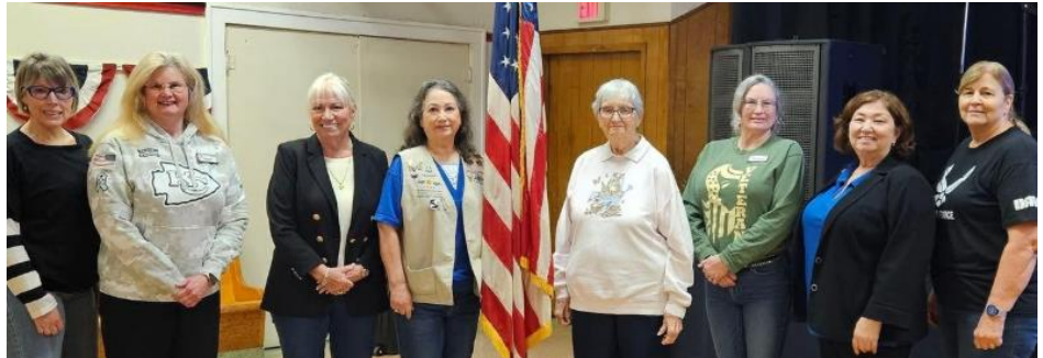
Tulsa and HQ Officers